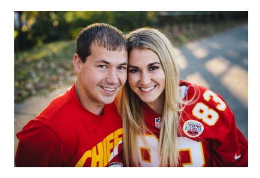
Sunday, August 6, 2017 From 2:00 to 5:00 P.M.

At Faith United Church 3025 Karnes Road St. Joseph, MO