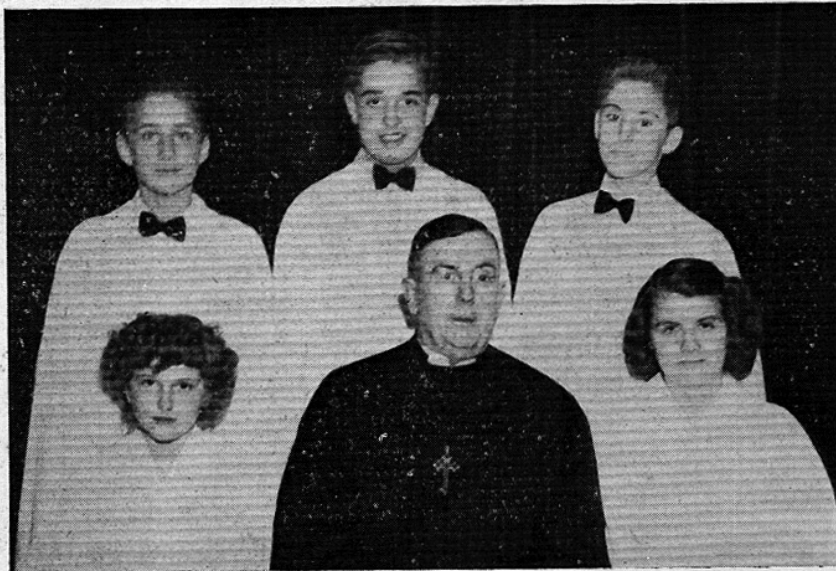
CONFIRMATION CLASS OF 1949

319 Confirmations. 11000 Communion. 300 Marriages. 414 Funerals